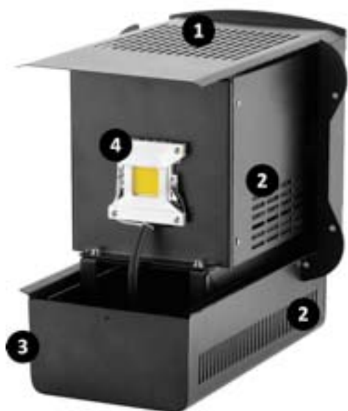
Fig. 2: LED module

Four beam-shaping shutters are supplied and these are fitted top, bottom, left and right in the gate area between the lens tube and LED module. An optional gobo (pattern) holder and an iris diaphragm are available.