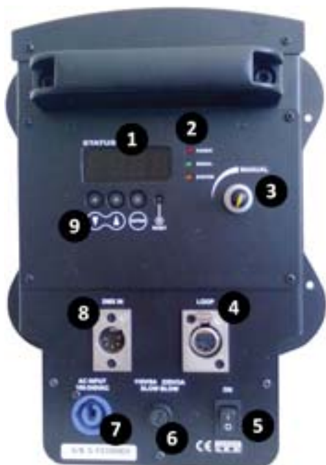
Fig 3: Rear Panel details

Note: The intensity DMX address must be set as a unique number and not used for other remote-control functions. Remote-control DMX addresses must be independent from any master control on the desk (master scene fader, blackout switch etc.) to ensure that preferences set by DMX level do not change during a fade.