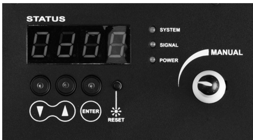
Fig 4: Control panel details

STATUS: 7-segment, 4-digit display for DMX address and system setup and status details.