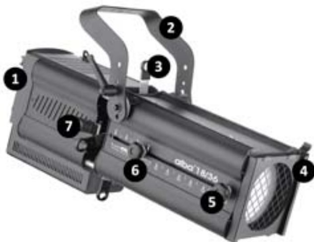
Fig. 1: Main features and controls